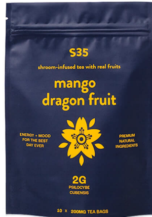
Mango Dragon Fruit 200mg