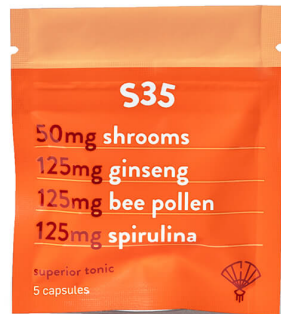
Superior Tonic 50mg