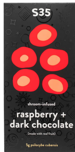
Raspberry Dark Chocolate