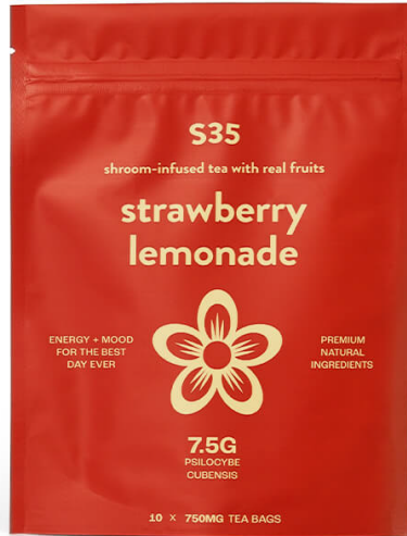
Strawberry Lemonade 750mg