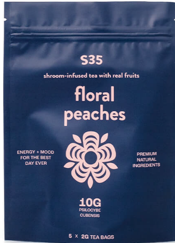
Floral Peaches 2g